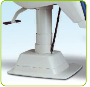
Exclusive <u>hydraulic</u> cylinder system.

reclining any size patient easy and instantaneous; no electronic motors to slow you down! The Marco E-Z Tilt also incorporates the only double hydraulic cylinder system in the industry, creating an extended range of elevation — from extra low to extra high, that accommodates a