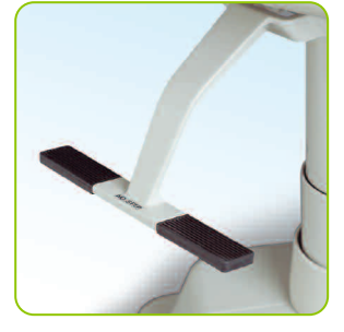
Foot-activated rotation lock can easily be activated from both sides of the chair.

and unnecessary components, resulting in much greater reliability.