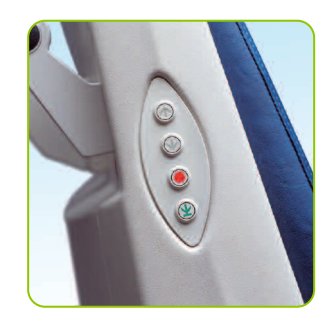
New overlay switch panels on both sides of the chair for convenient fingertip adjustments.