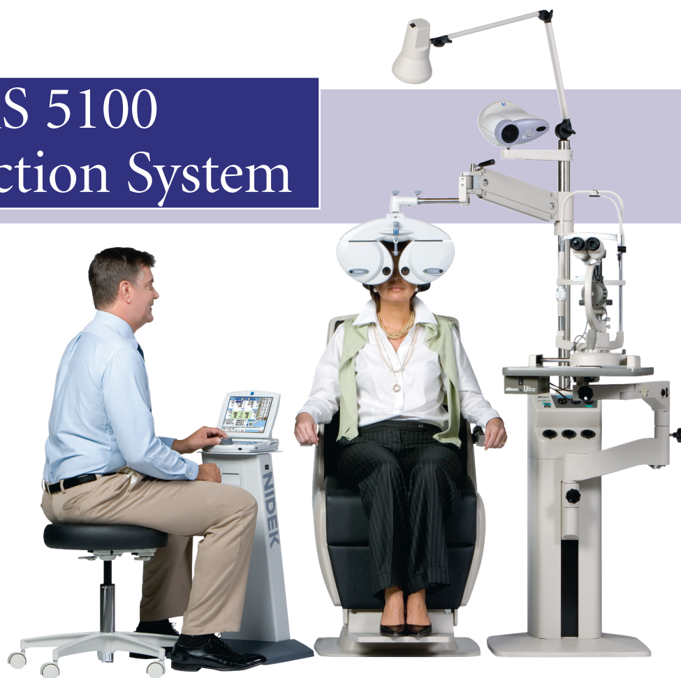
The TRS-5100 and the CP770

IN THE COMPUTING WORLD, there is something known as Moore's Law. Moore's Law says that computer speeds will roughly double every two years. As I look back over the last twenty years, I think we can extrapolate that two other things occur along with Moore's Law. One is that access to information and the volume of information grow at similar rates. Second, larger and more complex interfaces for information exchange develop to meet the growing speed of access and volume of information.