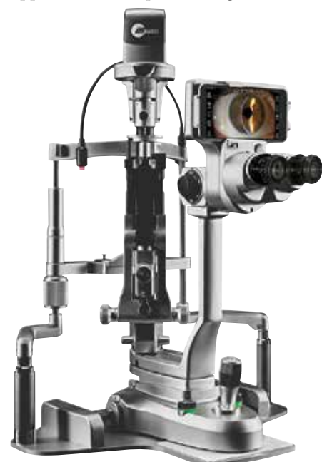
Ultra M5 Series Slit Lamp Integrated connections for digital imaging systems. (Marco ION IMAGING SM shown)

A system that you will want in every exam room, not missing the opportunity to capture, integrate and educate every diagnosis.