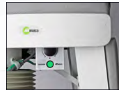
EASY, "DIAL-IN" PROGRAMMING CONTROL WITH SAFETY SWITCH TO DISABLE CHAIR OPERATION

The Marco Encore Automatic Chair features an exclusive hydraulic system that controls both the elevation and recline motion. Easy-to-use backlit fingertip switches control all functions of the chair, as well as programmable recline positions, auto-recline/return, and safety functions. A corded foot pedal and single-handed operation headrest are also standard. Optional surgical accessories are available for minor surgical procedures.