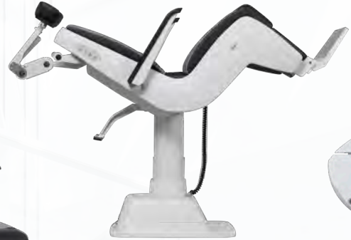
EXCLUSIVE TELESCOPING HYDRAULIC CYLINDER SYSTEM