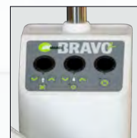
BRAVO 2 MEMBRANE CONSOLE PANEL

The Bravo 2 Instrument Stand from Marco combines a fresh, new updated design with our high standards of performance, function, and durability. With a strong emphasis on simplicity and economy, the Bravo 2 stand provides the perfect blend of everyday efficiency and value.