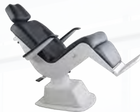
BRAVO 2, EFFORTLESS TILT